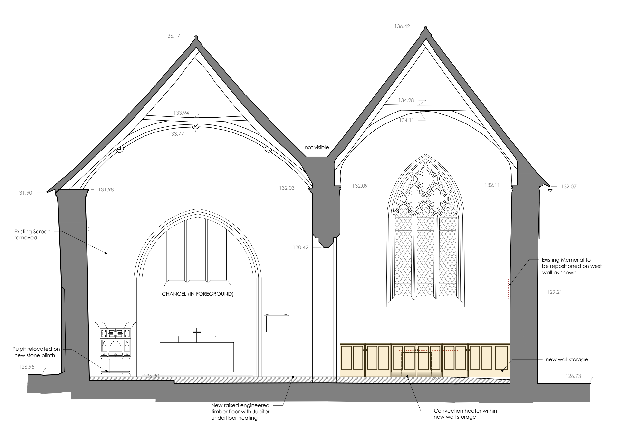
Proposed East Facing Interior Elevation/ Section